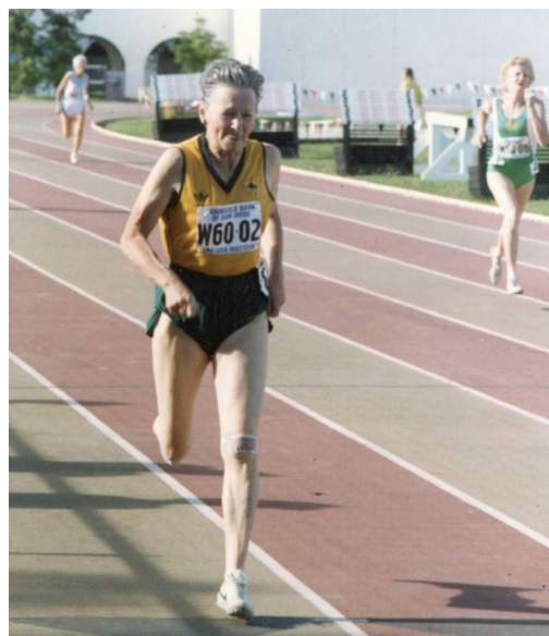
San Diego 1989

Ann was a wonderful role model for upcoming younger athletes.